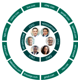
Map and Authenticate Identities

Fortra Email Security leverages its Identity Graph, an advanced artificial intelligence and machine learning system that ingests data telemetry from more than two trillion emails per year to model email sender and recipient identity characteristics, behavioral norms, and personal, organizational, and industry-level relationships to detect sophisticated identity deception attacks.