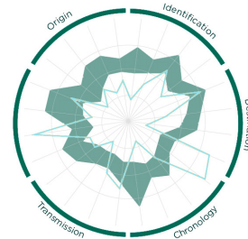
Score Message vs. Expected Behavior